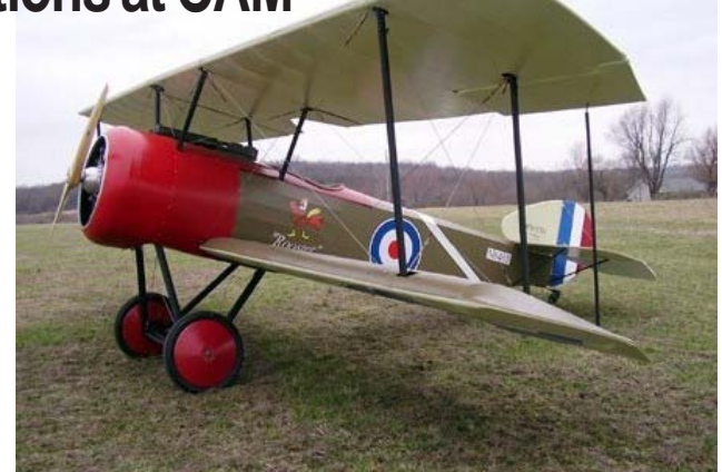
The Pup, before engine and propeller were removed

The plan is to lower the Pfalz E1 and hang it in a new position in the southwest sector of Hangar 602 above the Meyers OTW . The Pup will then be raised on the rig that previously held the Pfalz .